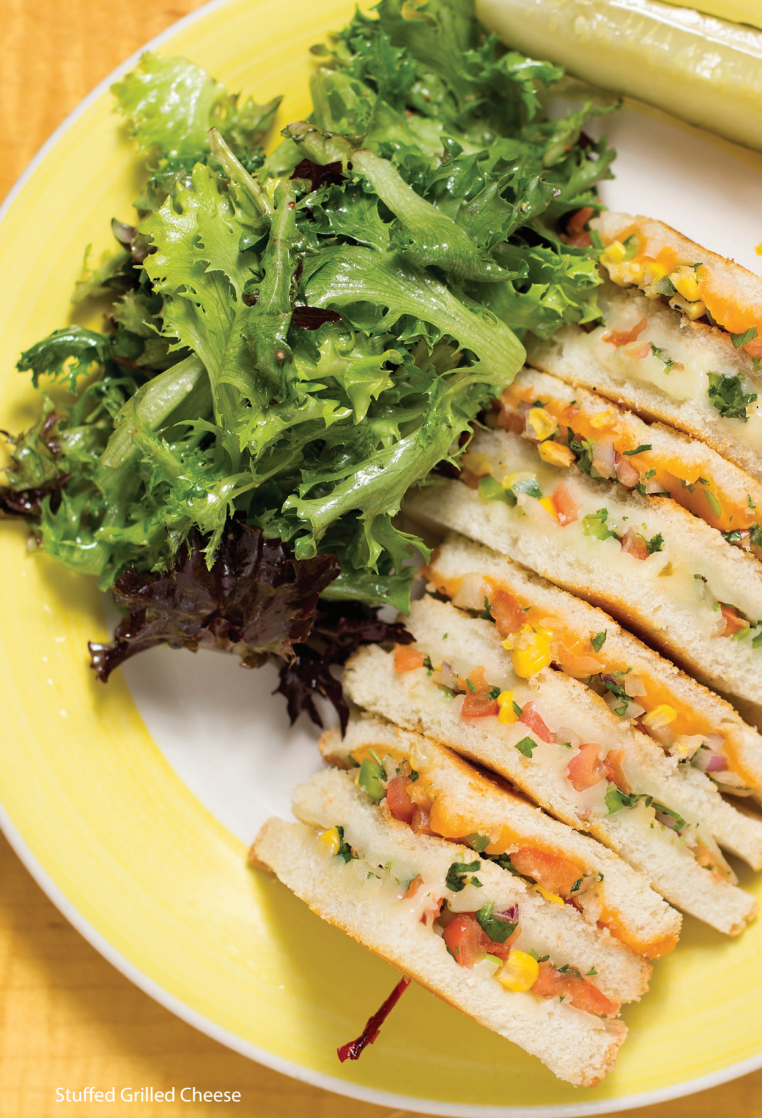
Stuffed Grilled Cheese