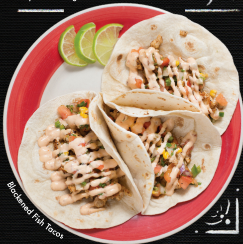
Blackened Fish Tacos